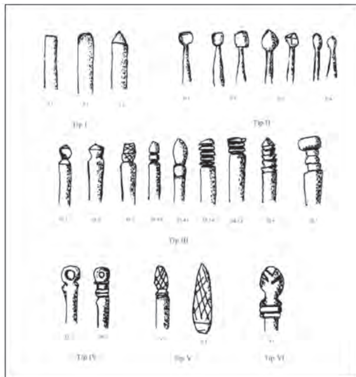
Fig. 1. Typology of hairpins from Porolissum (taken from Váss 2013, 69).

A good while of time, bone or antler artifacts from Dacia and Apulum were not in the attention of researchers due their cheap fabrication material. Only in the last three decades this types of objects were treated as real artifacts. The first typology of hairpins from Dacia was realized in 1991 4 and it envisaged the artifacts discovered in Porolissum. The research from Porolissum has been recently completed by L. Váss' work 5 . The typologies included in the two studies have mainly used as classification criterion the proportion between the head and body of the pin, while for the other types and subtypes they have envisaged the development of head ornaments, from simple to elaborate.