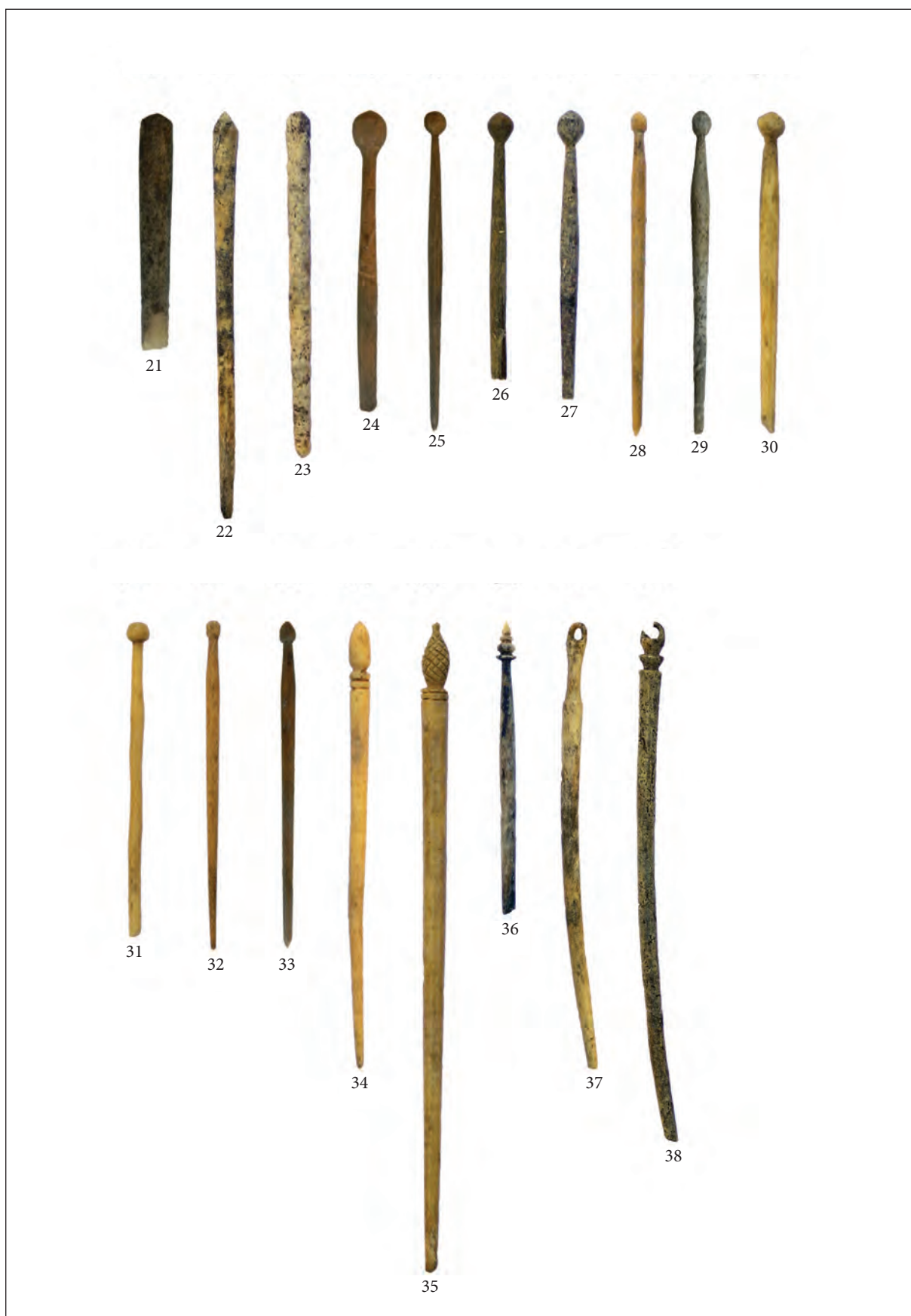
Plate II. Bone Hairpins Discovered on the Territory of Colonia Aurelia Apulensis .