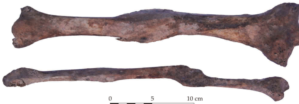
Fig. 1. Healed fracture on the left side tibia and fibula

The situation of the right side clavicle is also interesting, since it shows a completely healed fracture in the distal half of the clavicular body, more precisely in the area of the conoid tubercle (Fig. 3). Due to the fracture, the length of the clavicle was reduced by ca. 0.8 cm (the maximum length of the right side clavicle is of 13.3 cm, while the maximum length of the left side clavicle is of 14.1 cm). It is possible that this fracture took place in the same time as that of the lower left limb, during falling.