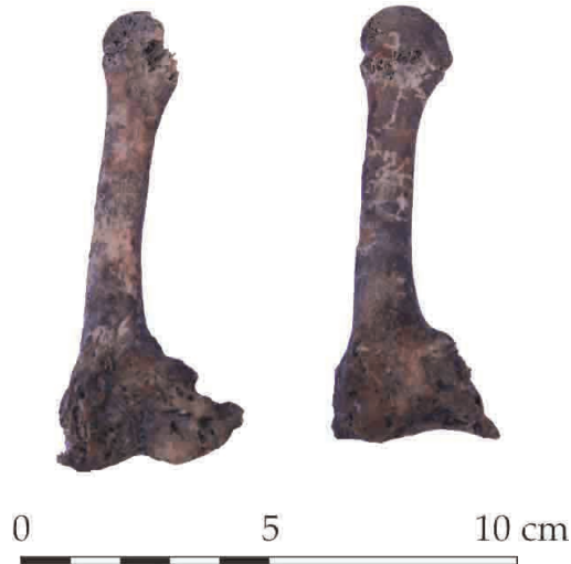
Fig. 5. Metatarsus I and II with arthrosic modifications on the distal epiphyses

Arthrosic modifications can be observed on the level of the distal epiphysis of metatarsus I and II on the right side (Fig. 5), possibly caused by mechanical stress exerted on the foot; for a significant period the individual only leaned on the right leg while walking.