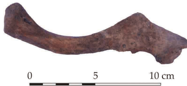
Fig. 3. The right side clavicle with a completely healed fracture on the distal half of the body