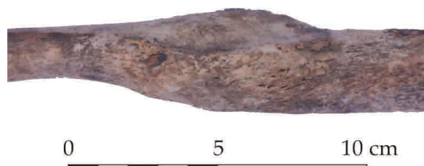
Fig. 2. The formation of callus with infection signs in the area of the fracture on the left tibia diaphysis