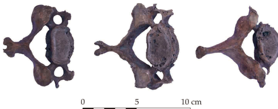
Fig. 4. Cervical vertebrae with signs of degenerative pathology

On the body of the three final cervical vertebrae (C5, C6, and C7) one can observe the presence of Schmorl Nodules, both on the upper and lower surfaces, while osteophytes can be noted on the thoracic and lumbar vertebrae, on the anterior side of the articular margins (Fig. 4). These might indicate a disc herniation that causes the space between the intervertebral discs to narrow. The degenerative pathology on the level of the spine is among the most common lesions discovered on skeletons from the past. Unfortunately, the dimensions of the space between the intervertebral discs cannot be measured accurately since, in such cases, the spine is disarticulated 13 .